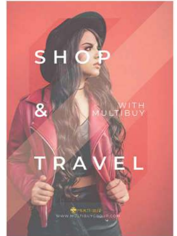
SHOPPING & TRAVEL